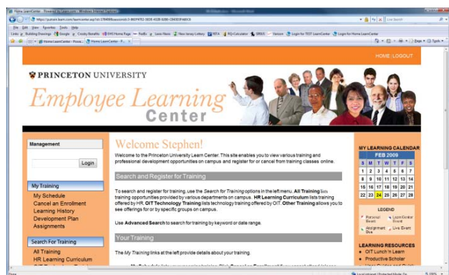
Employee Learning Center – Main Page

The University has a brand new training site ( www.princeton.edu/training ) for students, faculty and staff designed to provide the campus community with a single location for all of its training needs. This web-based training management system allows individuals to review their own training history as well as view upcoming training sessions offered by several University offices including; Human Resources, OIT, General Council, and EHS. Individuals may enroll in training sessions as they wish, right from the Learning Center.