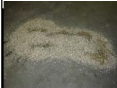
Scoop up carefully