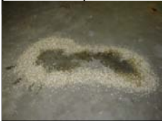
Work from outside in