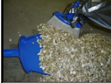
Place in container for disposal