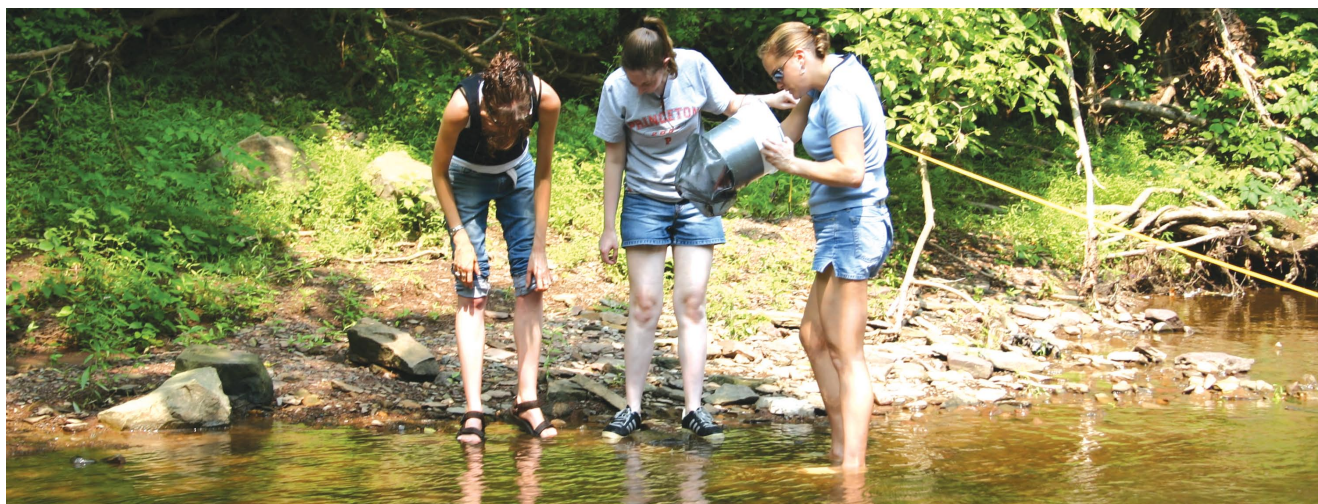
Middle school teachers from central New Jersey take water samples during field work at the CEBIC Summer Institute.

As part of the CEBIC Summer Undergraduate Research Fellowship Program, 13 undergraduates were awarded eight-week fellowships in CEBIC laboratories. A central outreach focus for CEBIC has been to increase ties to local community colleges. Three of the summer fellows were from Mercer County Community College and Middlesex County College in central New Jersey. The students participated in research in bioremediation with bacteria and/or the effects of trace metals on diatom and bacteria growth. CEBIC